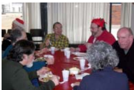
Enjoying food and the company of friends at the holiday party.