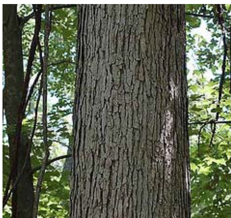
White Oak Bark

The cambium enables a tree to live and grow. Each year it builds another layer of sapwood and also a layer of bark. The sapwood conducts water and dissolved nutrients, taken from the soil